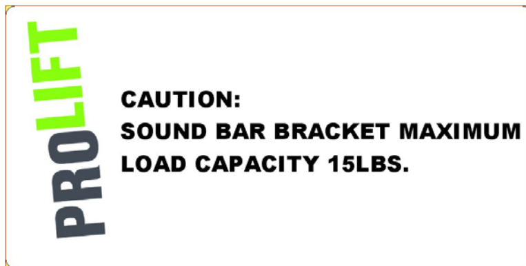
Figure 1: Sound Bar Bracket Maximum Load Capacity

The following figure show the label found on the G5ZL unit.